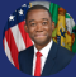
Wally Adeyemo Deputy Secretary of the Treasury