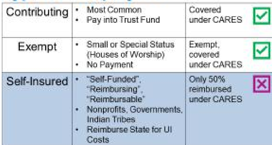
Unemployment Insurance - Types of Employers