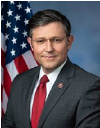
Speaker Mike Johnson

President-Elect Trump’s agenda. A clear difference emerges, however, in their focus on two policy issues of interest to the charitable community. Senator Thune has been the sponsor or lead cosponsor of several bills to improve nonprofit laws. Most recently, he stressed his support publicly and privately for creating a non-itemizer deduction during the 2025 tax reforms as a solution to the negative impact on giving that was caused when Congress doubled the standard deduction in 2017.