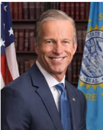
Senator John Thune

Last week, Republican Members of Congress elected their leaders for the 119 th Congress that begins on January 3, 2025. Both Speaker Mike Johnson (R-LA) and incoming Senate Majority Leader Thune (R-SD) are committed to advancing